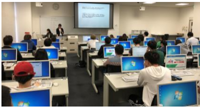
Presentation & Exchange