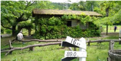
serenity at Mori Radio Station

A fter the Meeting held at Makuhari Messe, the organizers and participants of the JpGu2018 were given a chance to explore Chiba. The Chiba Convention Bureau in cooperation with many local organizations and agencies have prepared two courses for them to choose from, the Yama Course, and the Umi Course.