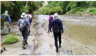
a walk to Chibanian