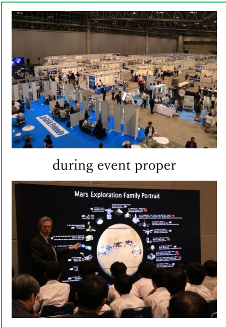
during event proper

The Japan Geoscience Union Meeting held a 5-day annual academic meeting at Makuhari Messe from May 20 to May 24, 2018. The meeting attracted about 8,000 participants from Japan and other parts of the globe.