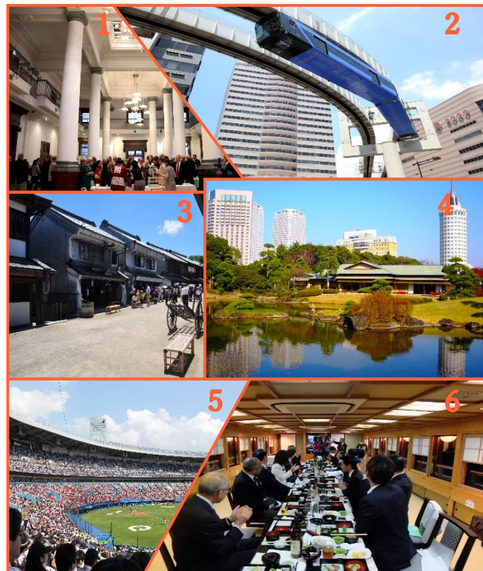
Photo: 1. Chiba City Museum of Art; 2. Chiba Urban Monorail; 3. Boso-no-Mura Open Air Museum; 4. Mihama-en Japanese Garden; 5. Zojo Marine Stadium; 6. Japanese Houseboat (Yakatabune)

Try unique venues of Chiba for an edge of memorable Japan experience!