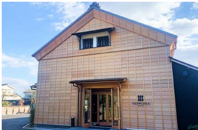
Sawara Merchant Town Hotel NIPPONIA KAGURA Building 佐原商家町ホテル NIPPONIA KAGURA 棟

Immerse yourself in the beauty of traditional Japanese architecture and its historical context within spaces that shaped Sawara's prosperity—over 200-year-old merchant house. The venue is perfect if you are looking for a tranquil and sophisticated environment. Also, enjoy delicacies made with locally sourced ingredients unique to this area—featuring fermented foods such as sake lees—paired with sake delivered directly from nearby breweries.