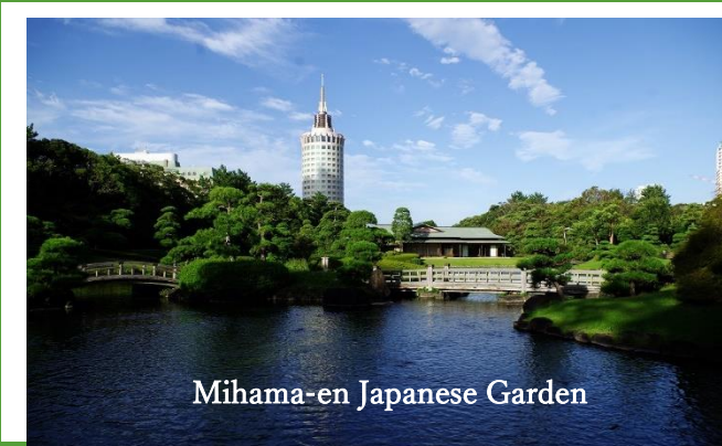
Mihama-en Japanese Garden