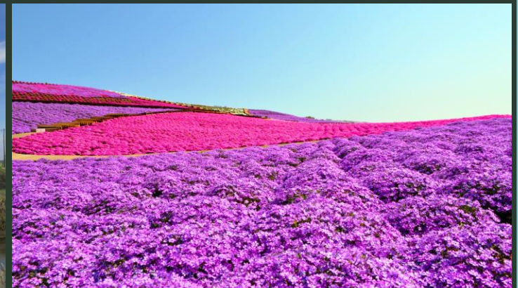
Tokyo German Village