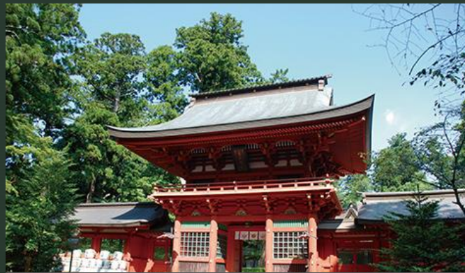
Katori Jingu Shrine