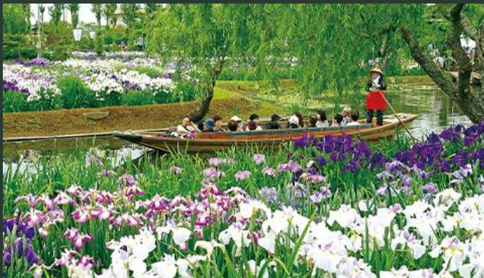
Suigo Sawara Iris Park

Edo Old-town Sawara, Katori Jingu Shrine, Museum of Aeronautical Sciences, Suigo Sawara Iris Park, etc.